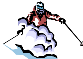
Great Powder Skiing

This is a wonderful trip to get to know other ski club members. We have breakfast together and we have a happy hour every night. The snow is good and we are the only ones on the mountain. Come join us for a fun filled week.