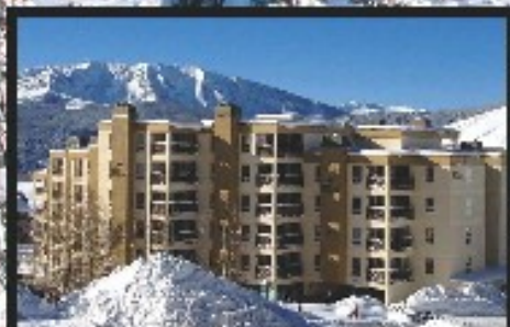
The Plaza Condominiums